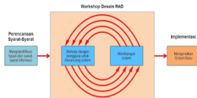
Figure 1 RAD Design Method

Analysis This stage aims to analyze all activities in the overall system architecture by involving the identification and description of the basic software system abstractions and their relationships. The activities to be carried out are as follows: